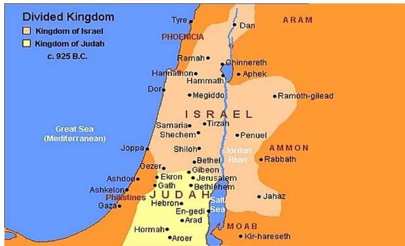
The Genealogy of the Kings of Ancient Israel and Judah